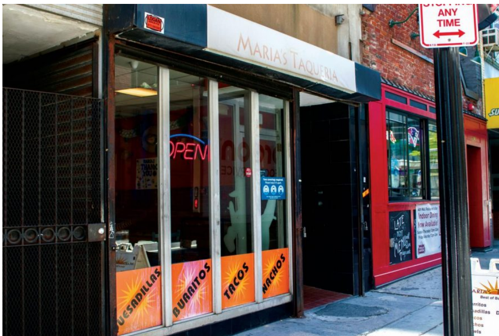
For some spots, like Maria's, college campuses reopening could boost their chances of turning a profit in a year otherwise marred by financial ruin.